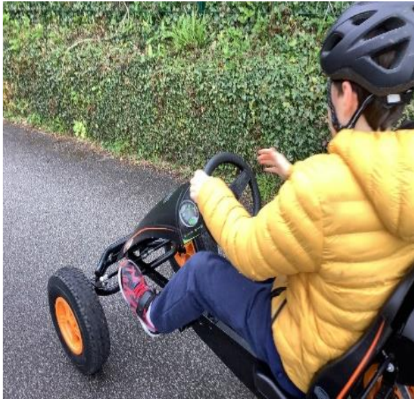
Test driving the new Go Karts