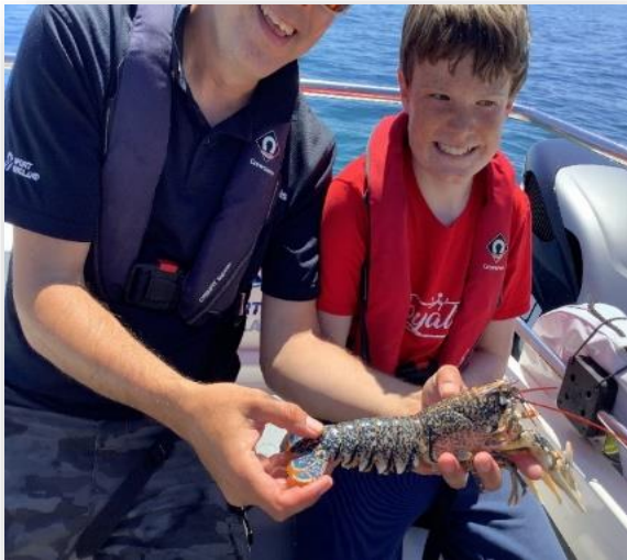
Out on the boat with Wet Wheels- What a discovery!