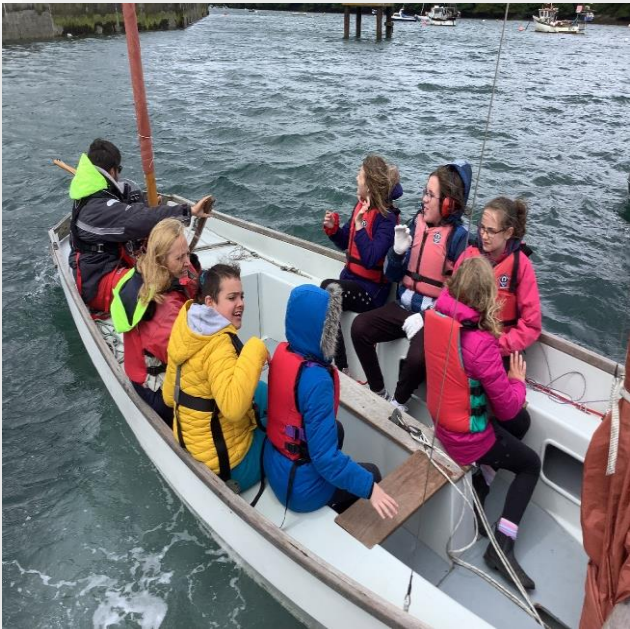
A windy day sailing @Mylor