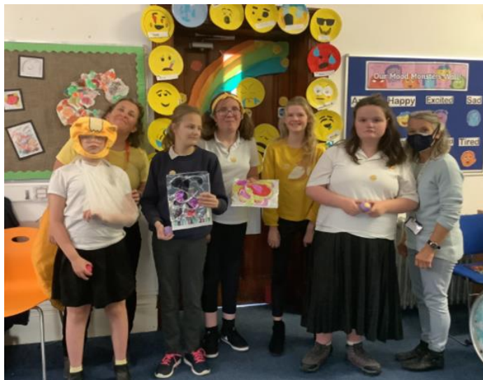
Photo of our prize-winning door to support Hello Yellow Day

Eden class has had a great start to the school year. In English we have been finding out about and writing about 'People who Help Us.' We had a lovely nurse come into class and visit, we asked her lots of interesting questions, we have also written about how firefighters, police and medical people help us. In Maths, we have been learning about place value and money, we have set up a shop and practiced buying sweets and toys with real money, counting it out and making totals using different coins. In Art, we have gone around the world and focused on the natural wonders of the world and created artwork based on Mount Everest, The Grand Canyon, The Great Barrier Reef and a Volcano. The students have done a super job and have really enjoyed the process. In RE and ASDAN we have been learning about the Christian Harvest Festival and recently we have been looking at Diwali where we have been making some traditional food in cooking, Diya lamps. Next week we will be making Rangoli patterns! In Science, we have been learning about rocks and how they are formed, we have looked at how fossils are formed and learnt about Mary Anning and the fossils that she found in Devon. In Geography, we have looked at the different continents, the water cycle including river drainage basins. We have made papier mache models which we will send home at the end of the term.