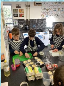
Great group work in cooking