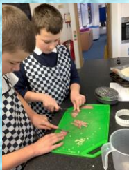
Making delicious pizza quiches