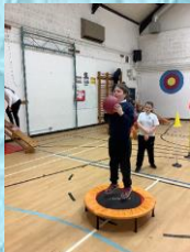
Enjoying sensory circuits in PE